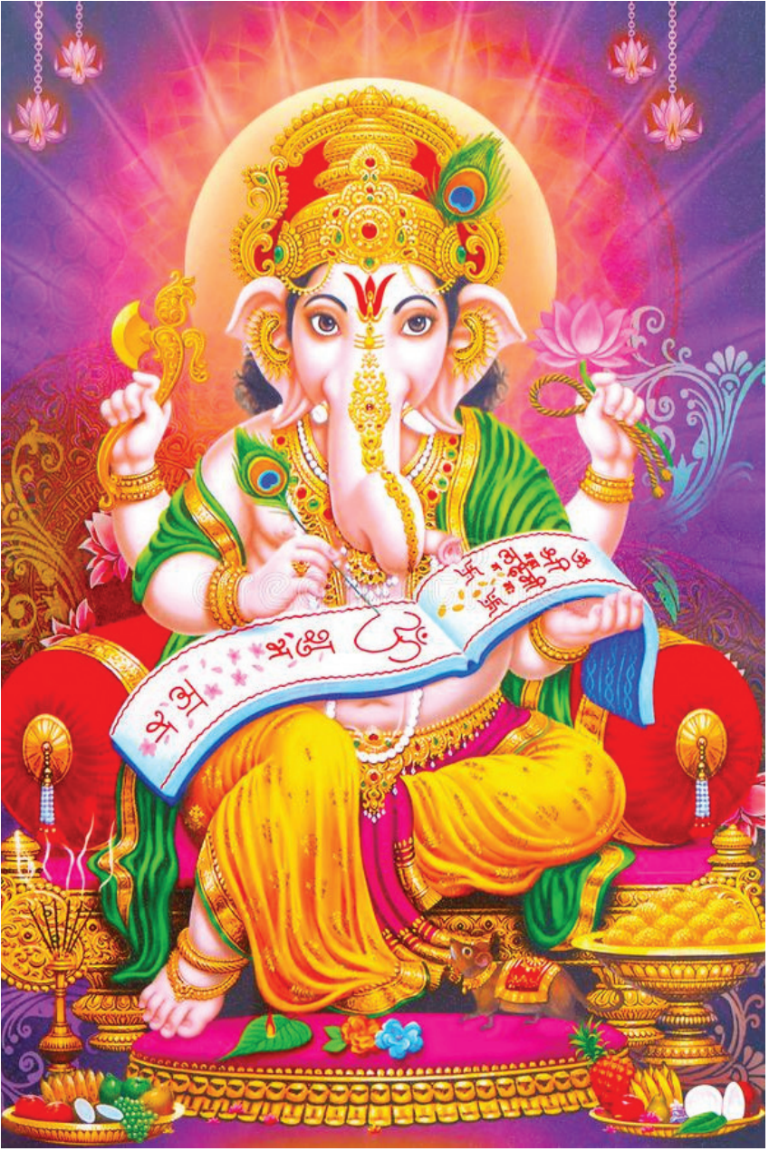
Lord Ganesha, The Remover of Obstacles